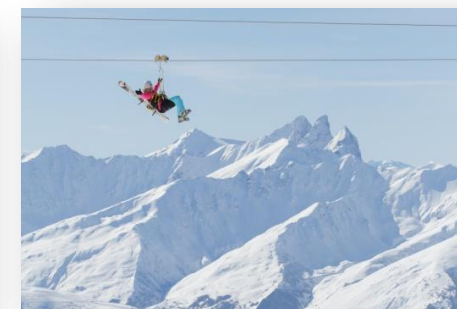
Mega Zip Line the highest in Europe