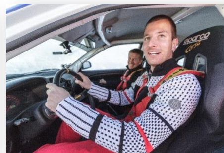
Ice driving with a kart or a car