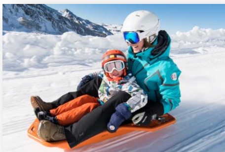
Le Toboggan 6 km of fun!