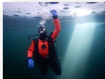
Ice diving in a frozen lake