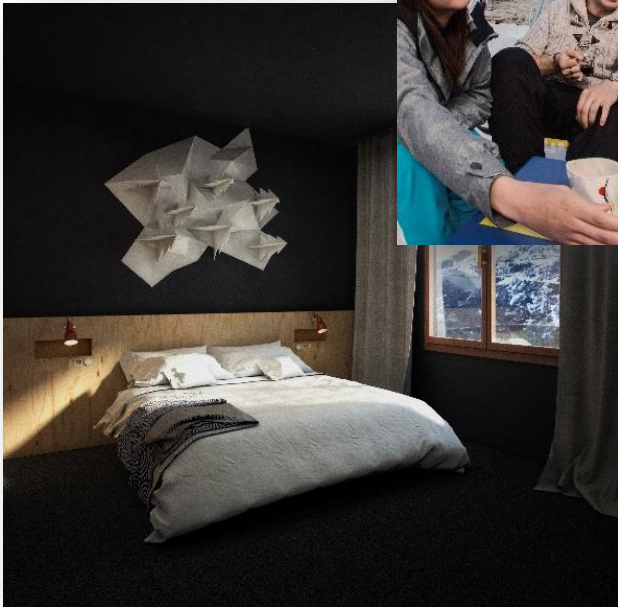
HO 36 Chambre / Selfie_D.André