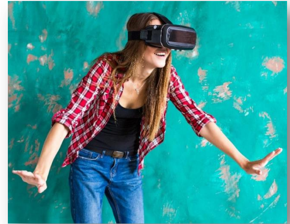
Menuires geek festival