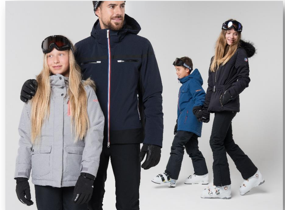
Adults and children _ Ski Chic