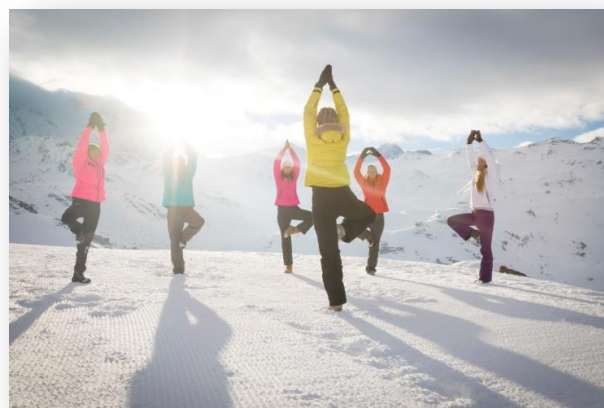
Yoga nature Wellness in the mountain